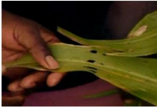
Holes on leaves is a sign of stem borer attack